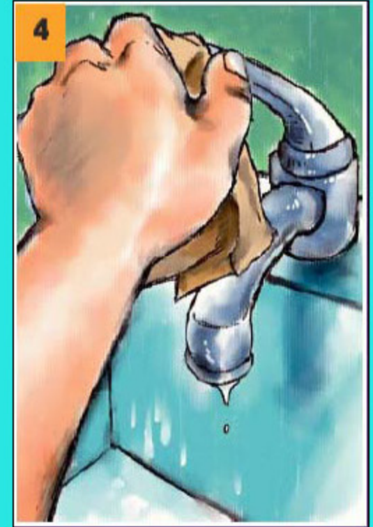
Use towel to turn off water and open door

Wash Hands Often to Protect Your Health and the Health of Your Family