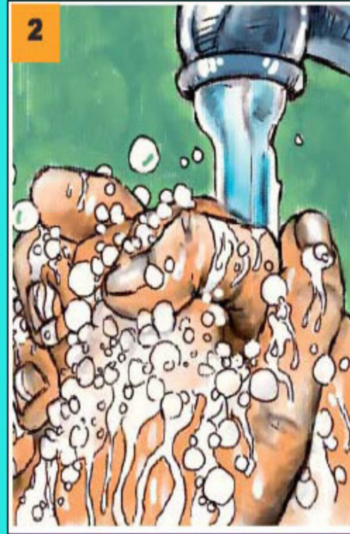
Apply soap; rub for 20 seconds and rinse