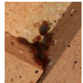
Bed bugs in crevices