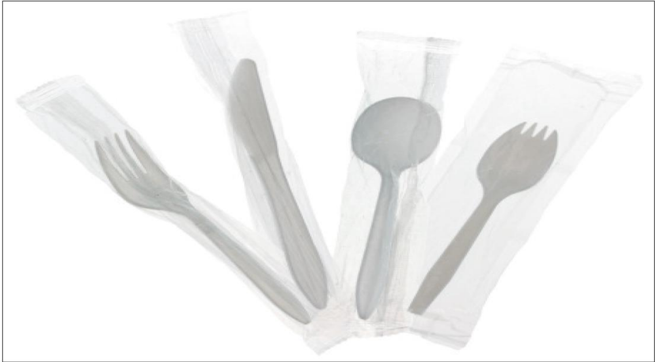
Picture 5: Single-use flatware (individually wrapped if customers can obtain these items themselves).