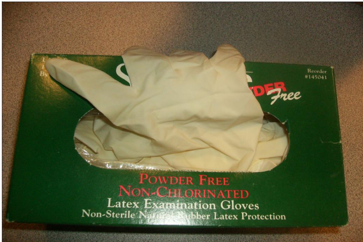
Picture 4: Single-use gloves (NO BARE HAND contact of ready-to-eat foods).