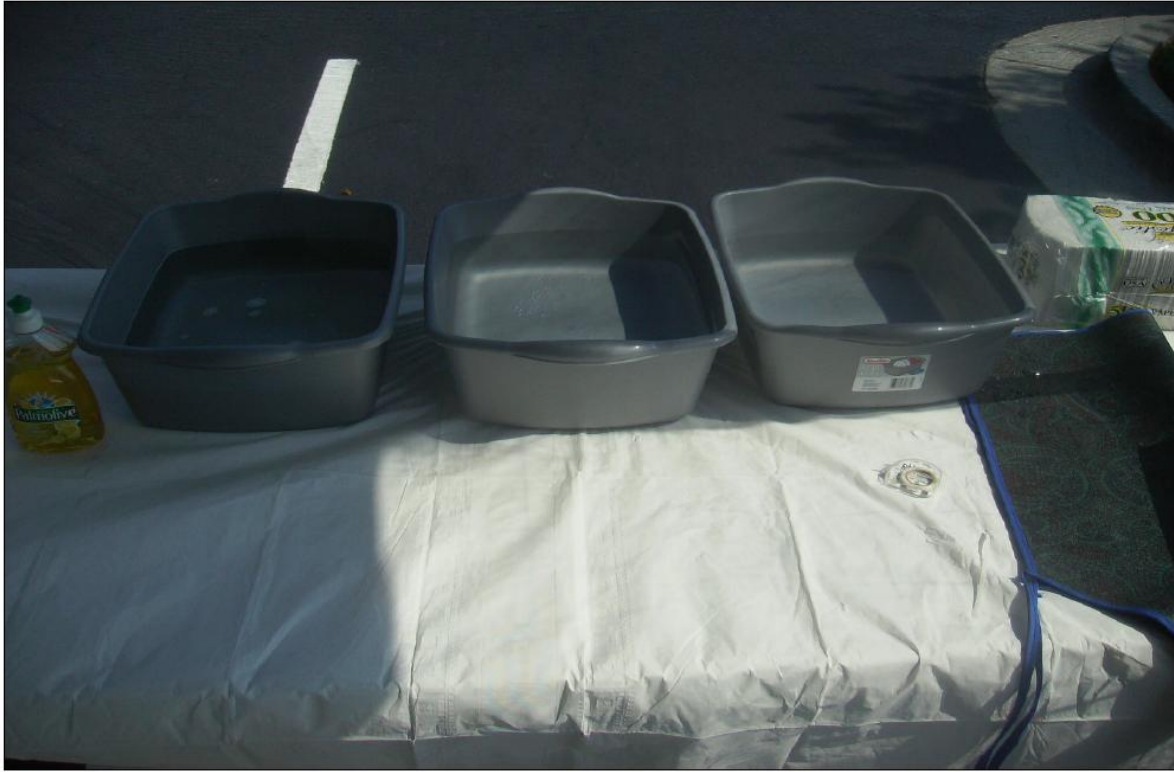
Picture 3: Rudimentary three-compartment sink (for washing, rinsing, and sanitizing utensils and equipment).