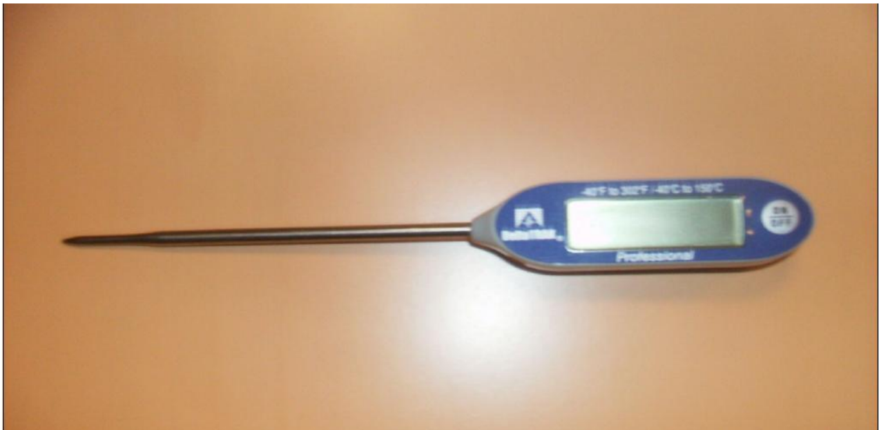
Picture 2: Digital thin-tipped PROBE thermometer for taking food temperatures.