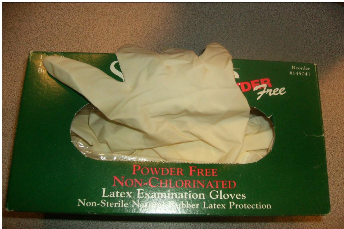
Picture 4: Single-use gloves (NO BARE HAND contact of ready-to-eat foods).