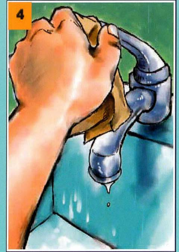
Use towel to turn off water and open door

Wash Hands Often to Protect Your Health and the Health of Your Family