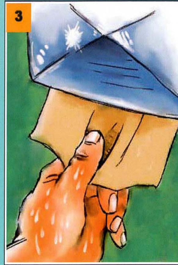
Dry with a single use paper towel