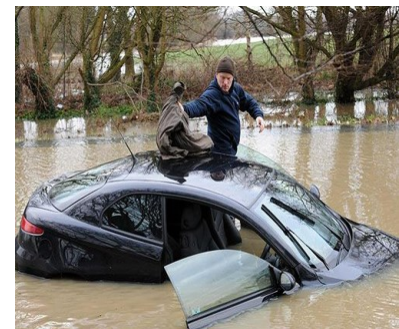
Turn Around Don't Drown

Prepare your finances for a flood's possible devastation. Yes, your finances. Cleaning up a water damaged home can set you back thousands of dollars. It simply makes sense to be prepared by having an insurance policy in place. To determine the financial impact it could have on your family, check out The Cost of Flooding tool at FloodSmart.gov .