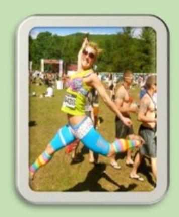
Environmental Epidemiologist District Office