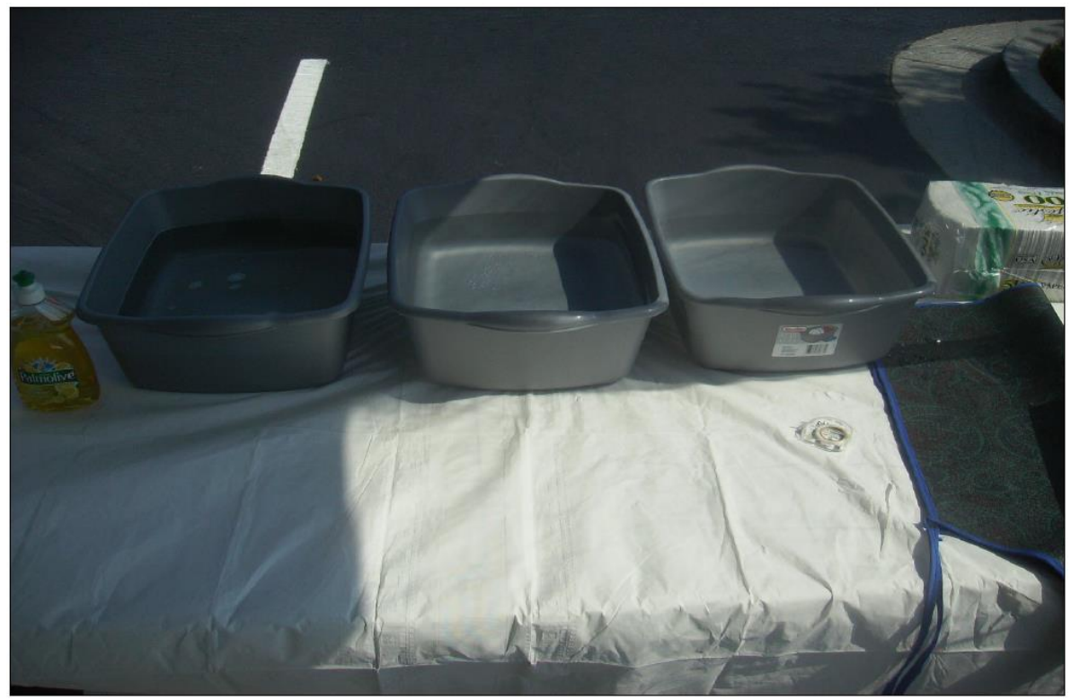
Picture 3: Rudimentary three-compartment sink (for washing, rinsing, and sanitizing utensils and equipment).