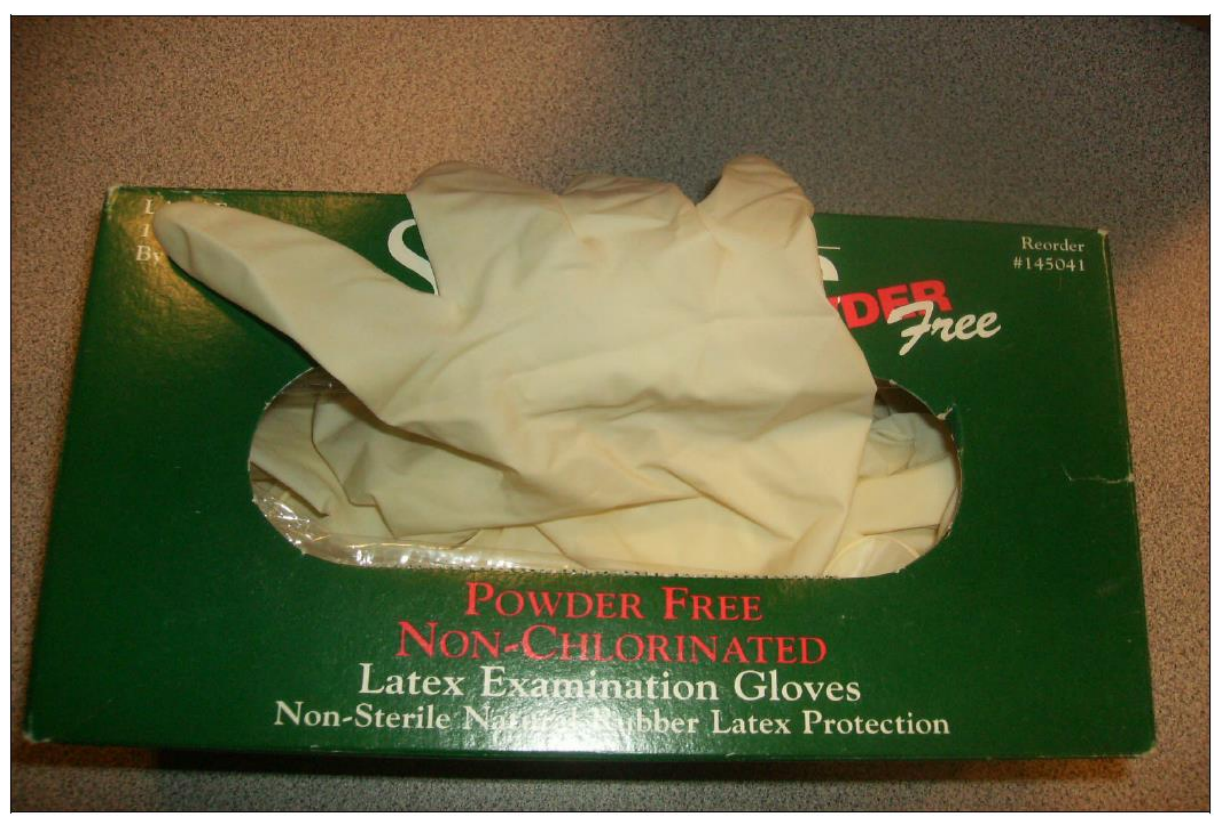
Picture 4: Single-use gloves (NO BARE HAND contact of ready-to-eat foods).