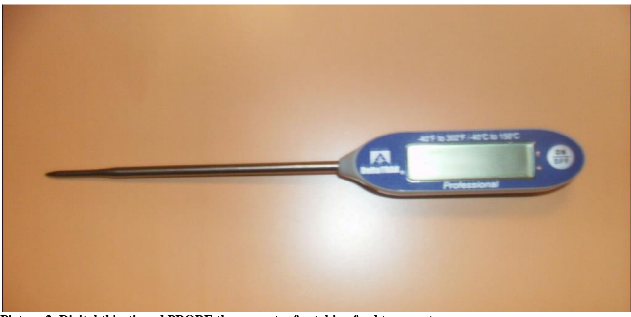
Picture 2: Digital thin-tipped PROBE thermometer for taking food temperatures.